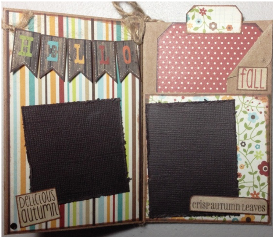
PAGES 5 AND 6