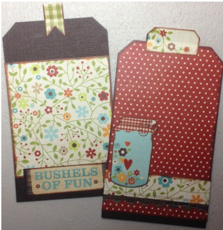
TAGS - SIDE ONE