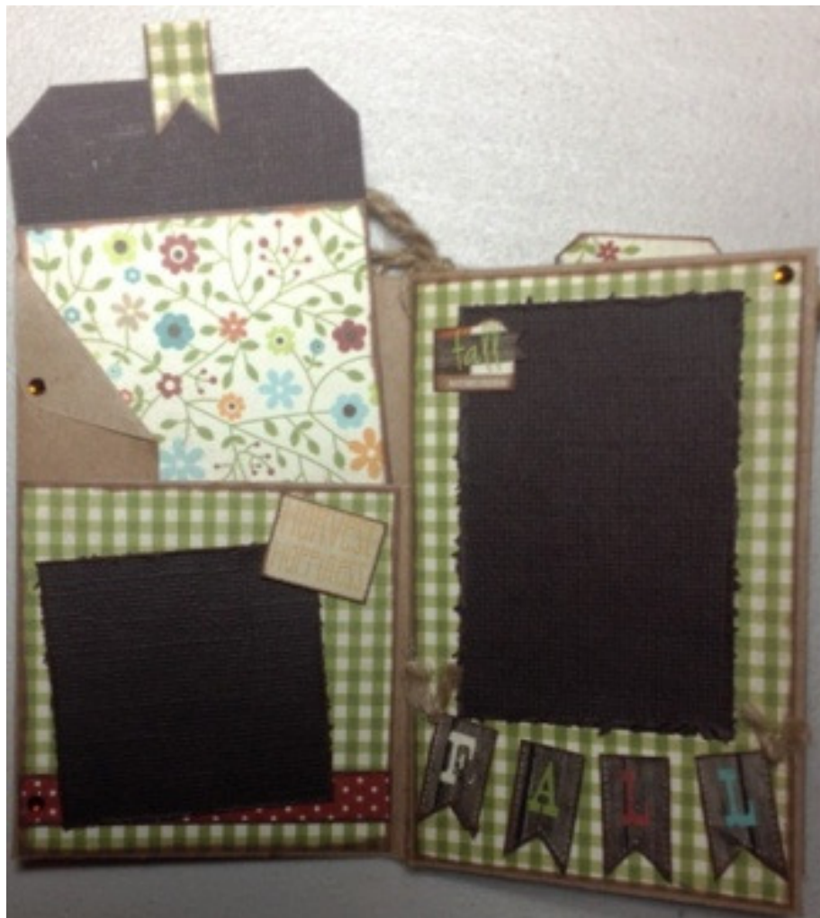
PAGES 1 AND 2