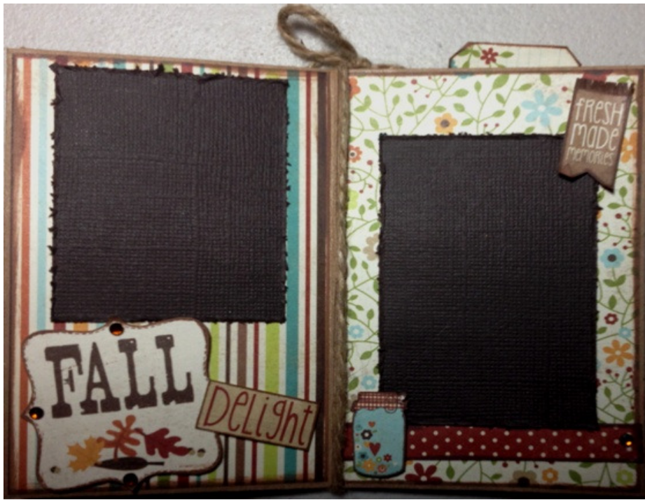
PAGES 3 AND 4