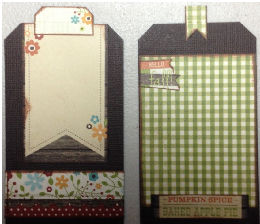
TAGS - SIDE TWO